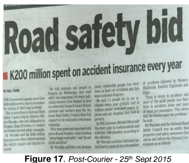
Figure 17. Post-Courier - 25th Sept 2015

The daily newspapers, The National and the Post Courier were invited to do the reporting on the rally events. The costs of their travel were met by NRSC including lodging. The background information such as the source of funding, the purpose of conducting road safety awareness and the lead-up event such as rally and any information that felt to be reported, we provided during the news conference. In our opinion they never did fairly a good job as the reporting was not about the rally but they did about road accidents or any other related road safety issues and included the rally activates as part of these stories. Figures 17-20 are the newspaper cuttings for the story covered.