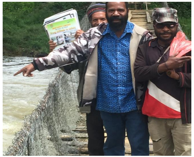
Figure 8. Youth Rep with locals giving a helping Hand, carrying the posters.

For the joy of seeing people equipped with the road safety messages, the road safety officers climbed mountains, crossed very dangerous bridges and withstood the scotching heat of the sun and overcame the supercilious cold of Kandep climate. In fact, most of the team members were passionate about delivering the road safety messages. They did the work from their heart as a matter of fact.