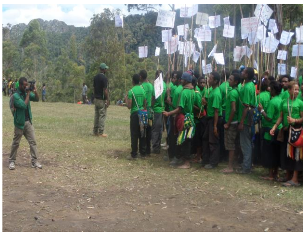
Figure 22. EM TV Capturing March at Kandep -2016