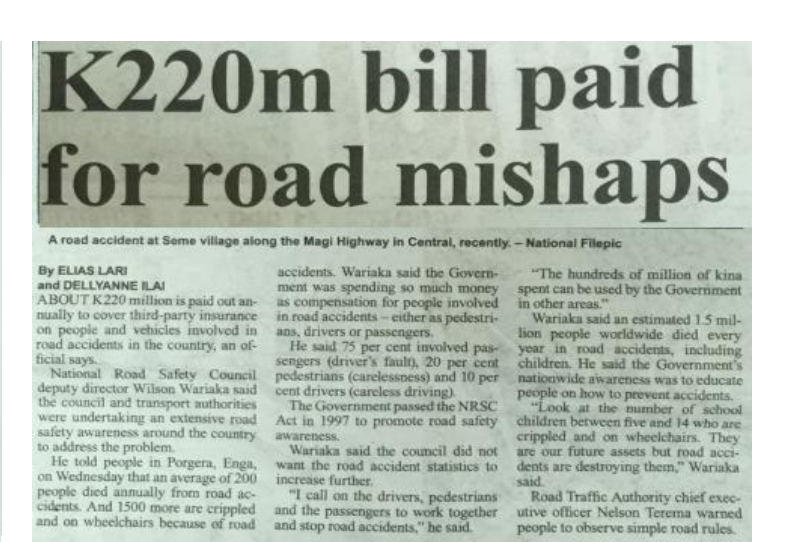
Figure 18. The National -25th Sept 2015