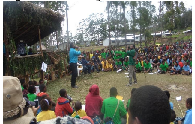
Figure 14 . Performance by The Josephs at the Rally Area.