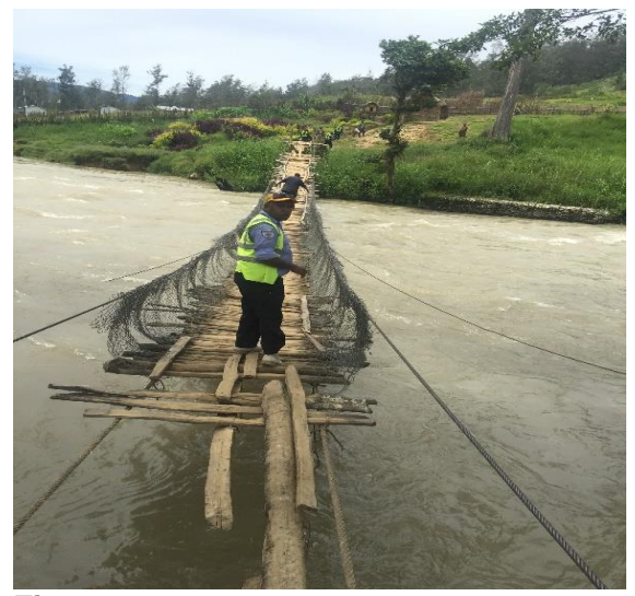
Figure 7 . Team Leader on a bridge connected by one log.