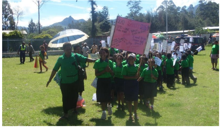
Figure 15. Marching into Momie Oval

As usual, the speeches were complimented by road safety songs which were composed by the Josephs. They were contracted by NRSC to compose songs in preparation for the rallies. In 2015. They did two songs which we used in Pogera Rally for Pogera-Laiagam Road Safety Awareness Campaign. Those songs really touched the hearts and souls of people of Mendi including the students. As pointed out earlier, it is anticipated that the impact should last a bit longer. About 3000 posters were distributed. The rally ended at around 1 o'clock in the afternoon. Figures 15-16 show some of the highlights.