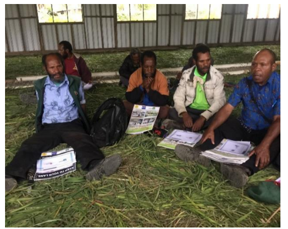
Figure 5. Discussing messages in the Posters during the training session. (Kandep Youth)