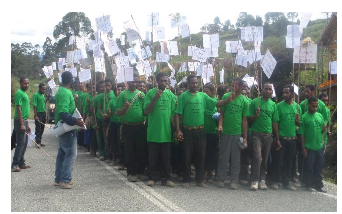
Figure 11. Getting Ready for the March

In between the speeches, The Josephs performed songs to keep the audience in lively manner. All the speakers made remarkable speeches and stressed the point that road accident is a killer and that people must take necessary precautionary measures to minimize it. In their speeches most of the speakers acknowledged ADB and the government for providing vital services such as roads and funding such events. The people were grateful of the developments that are taking place through the assistance of ADB. About 3 000 posters were distributed. The rally ended in the afternoon at about 3 o'clock. Figures 11-14 show some highlights of the event.