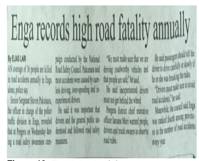
Figure 19. The National 25th Sept 2015