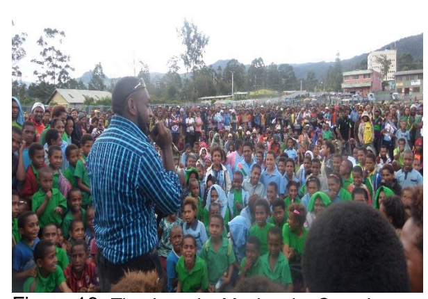
Figure 16. The Josephs Moving the Crowd