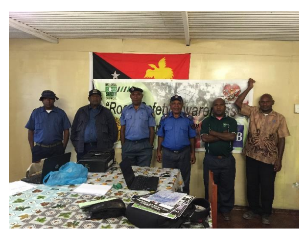
Figure 2 . Taking a shoot after the training with the Road Safety Awareness Campaign Banner.