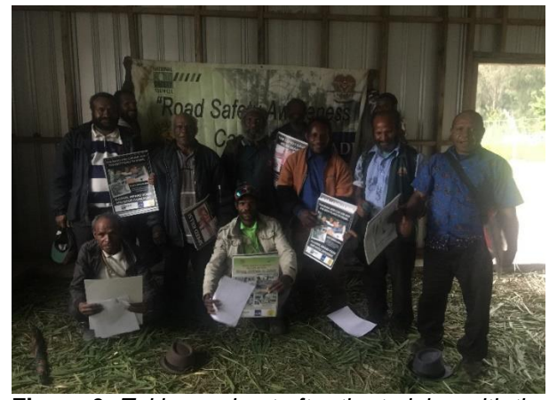
Figure 6. Taking a shoot after the training with the Road Safety Awareness Campaign Banner.