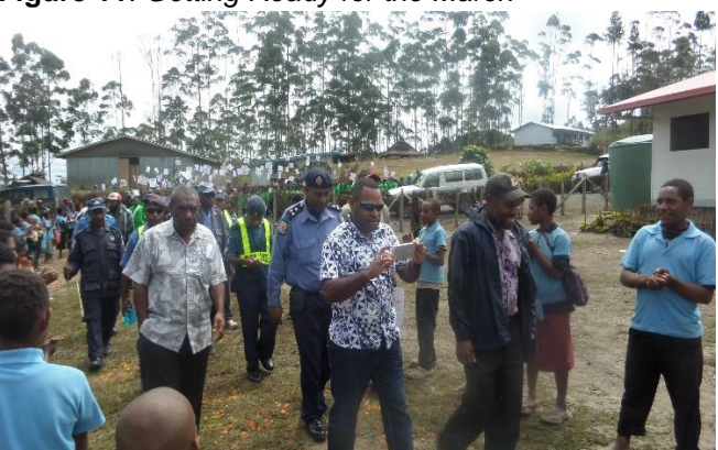
Figure 13. Dignitaries & Marching Students Entering the Rally Area