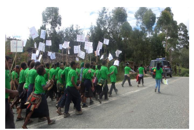
Figure 12. March in Progress.