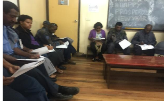
Figure 3 . Discussing messages in the Posters during the training session. (Police Training)